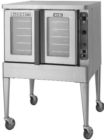
Shown with optional casters and digital control

Project _____ Item No. _____ Quantity _____